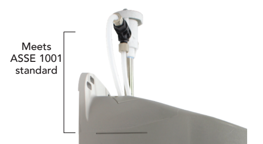
Molded Flood Line Shows acceptable distance to vacuum breaker