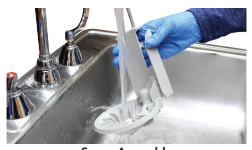
Spray Assembly Easy to Remove for Cleaning