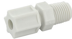
Plastic Compression fitting * Available with Drain Chief Plus only