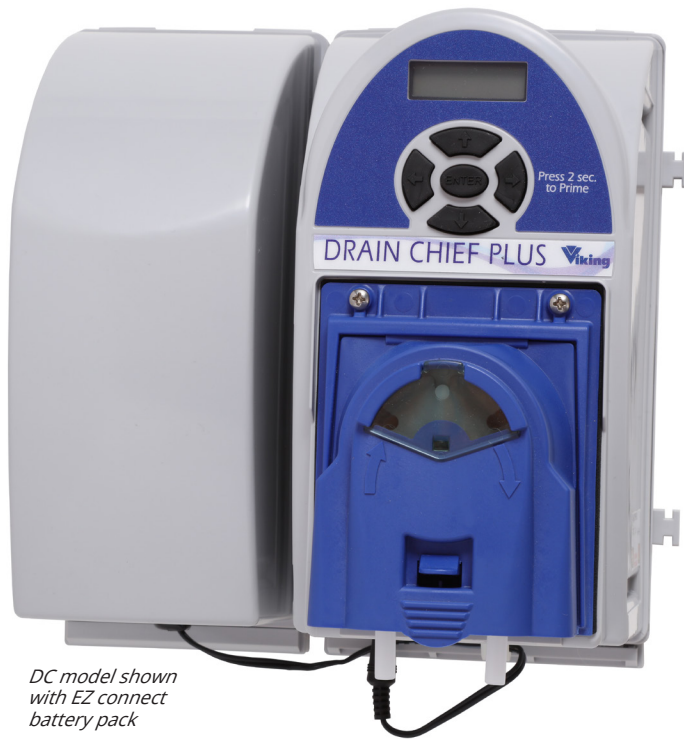
DC model shown with EZ connect battery pack

Visit Us Online At www.thevikingbowl.com